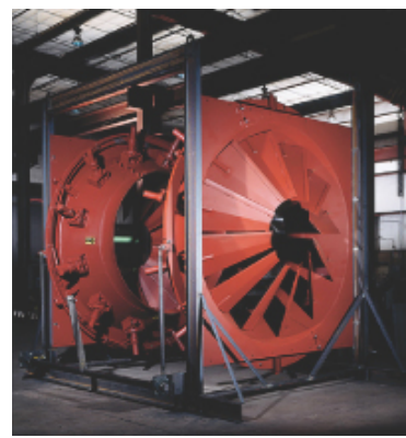
Effox Rotary Vane Damper for a Power Generating Plant