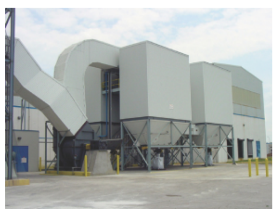
CECOAire Baghouse at an Aluminum Smelting Facility