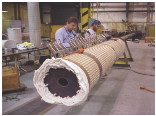
CECO Filters Fiberbed Filter Being Assembled