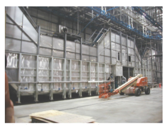
H.M. White Phosphate and E Coat Line Under Construction at an Automotive Plant