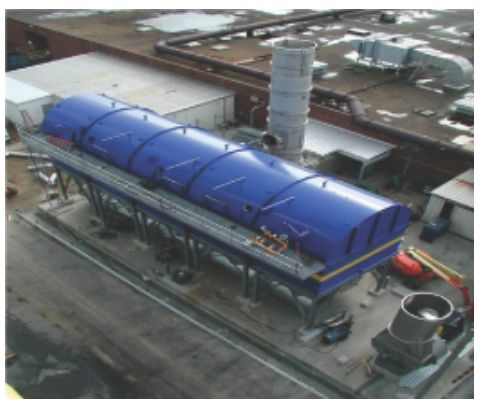
CECO Abatement Regenerative Thermal Oxidizer at a Chemical Plant